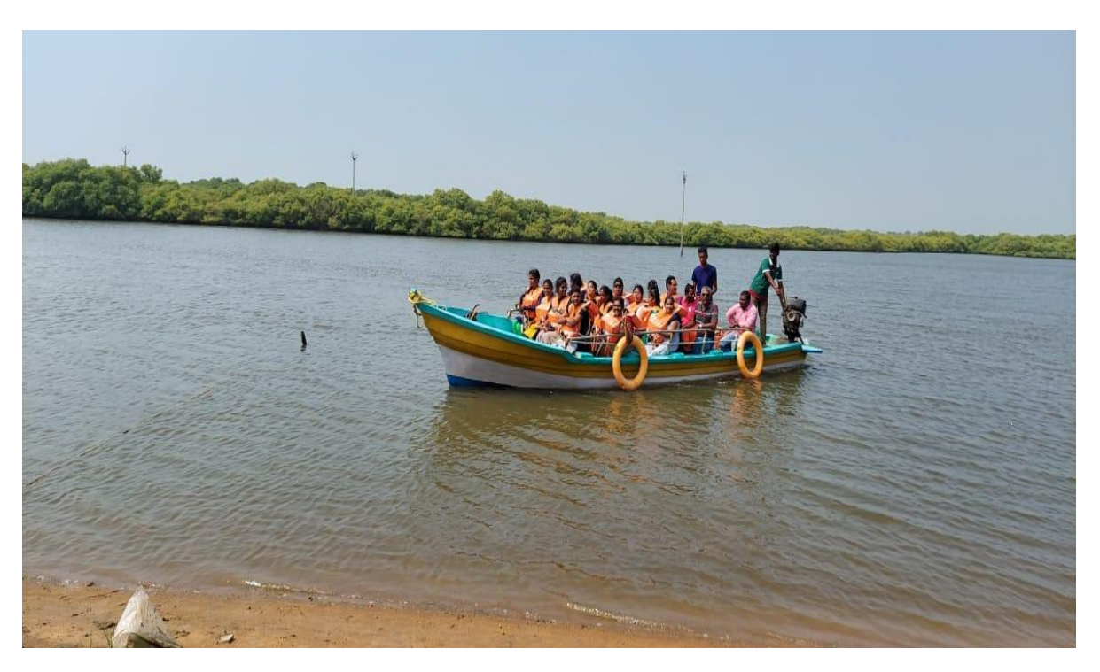
Boat ride in Karankadu mangrove