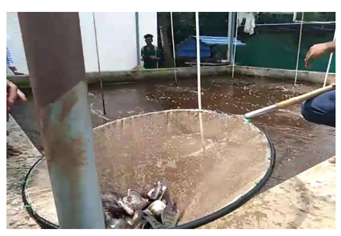
Koi carp farm