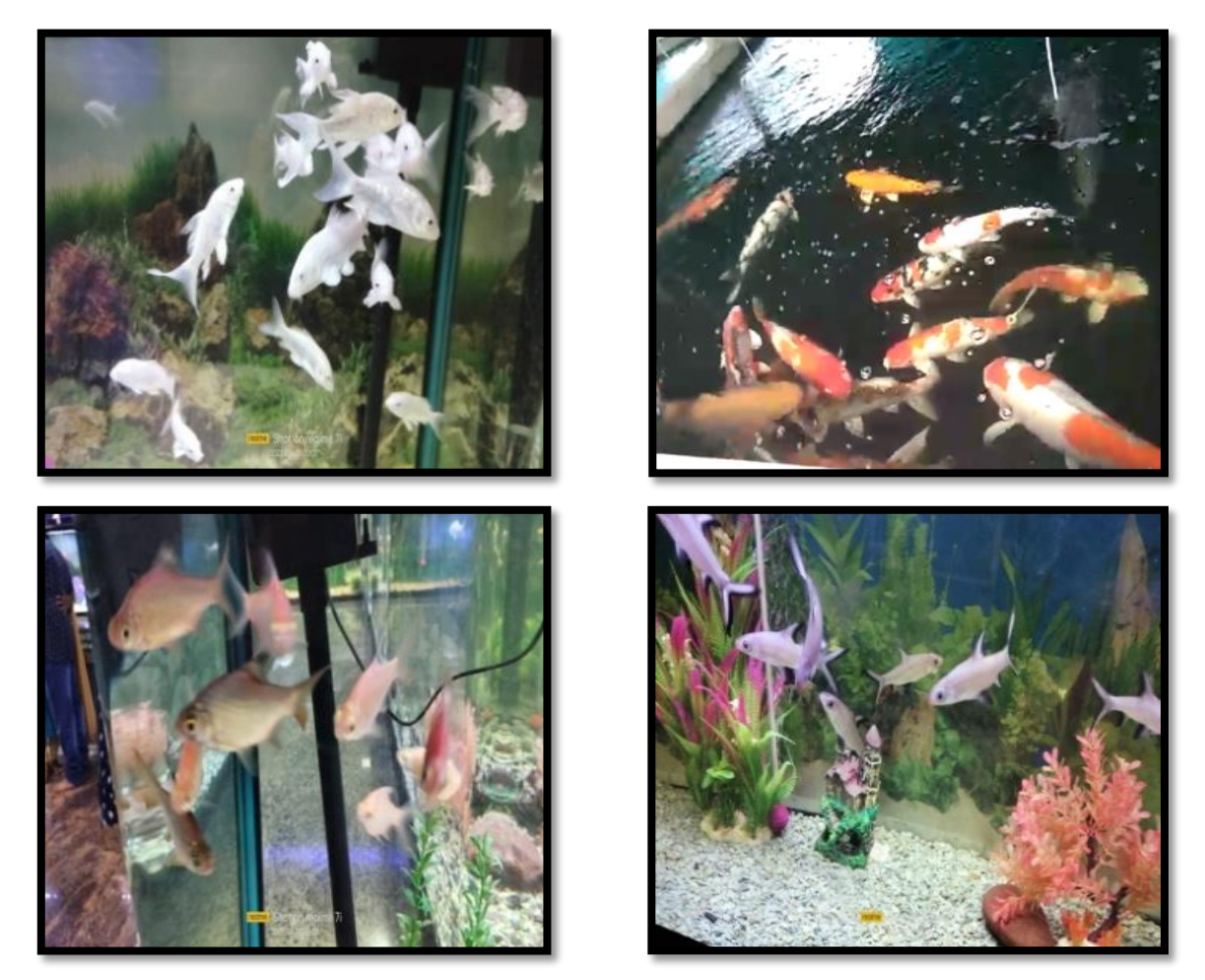
Freshwater Ornamental Fishes

The Western Ghats of India is one of the biodiversity 'hotspot' of the world. In Western Ghats, approximately 300 freshwater fish species are recorded. In that 155 species are considered ornamental fishes. Among them about 117 species are comes under the category of endemic. Rivers of northeastern states and their Himalayan streams have an abundant variety of ornamental fish species. Available varieties in the Western Ghats are Barbs, Rasboras, Killifishes, Glass fishes, Catfishes, Catopra, Hill trouts, and Danios. These species are suitable for the trading.