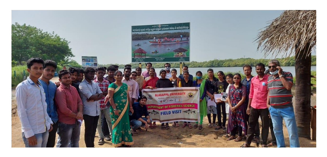
Visit to Karankadu Mangrove

Forest Department has been running a community-based eco-tourism project in Karankadu. Safety precautions were put in place and those involved in boating were strictly urged to wear lifejackets. The boating covers a distance of about two to three kilometers through the sea with mangrove colonies. The forest department arranged boat ride into the mangroves and into the sea.