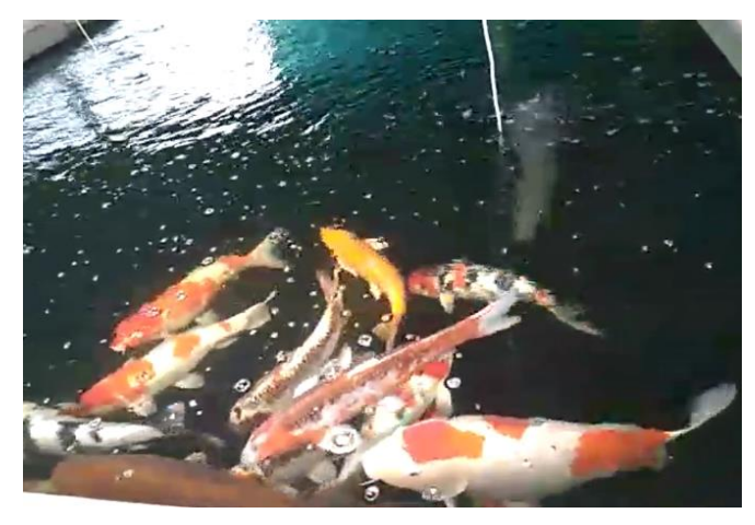
Koi fishes in P.V.R. Koi Center, Pudukottai

For industrial exposure, students of M.Sc. (Fisheries Science) 1st and 2nd year visited P.V.R Koi Centre, Permanadu in Pudukottai district on 12th December, 2021. In this farm, assembly of various culture systems like L. vannamei culture, GIFT Tilapia culture in biofloc, raceway aquaculture system (RAS) and multi business like bricks are done along with koi culture with major priority. Students learnt everything about culture, breeding and marketing of Koi carp (Cyprinus carpio) locally known as 'Nishikigoi'. Starting from 2011 this koi farm has been developing with lands of about 2 hectares comprising 10 mud ponds and 10 concrete ponds to manage and supervise large area fish farm for research and development. Students were privileged to get clear idea about the cost analysis of a farm setup which will be beneficial for their future plan. They also learnt the safety and sanitation protocol and their significance in fish farm. All the teaching faculties accompanied the students during the industrial visit and thanked them to provide an opportunity to the students for the industrial visit.