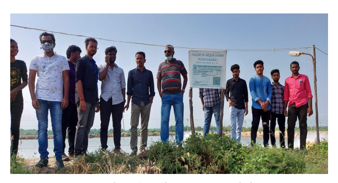
Visit to Tharun Aqua Shrimp Farm, Karankadu