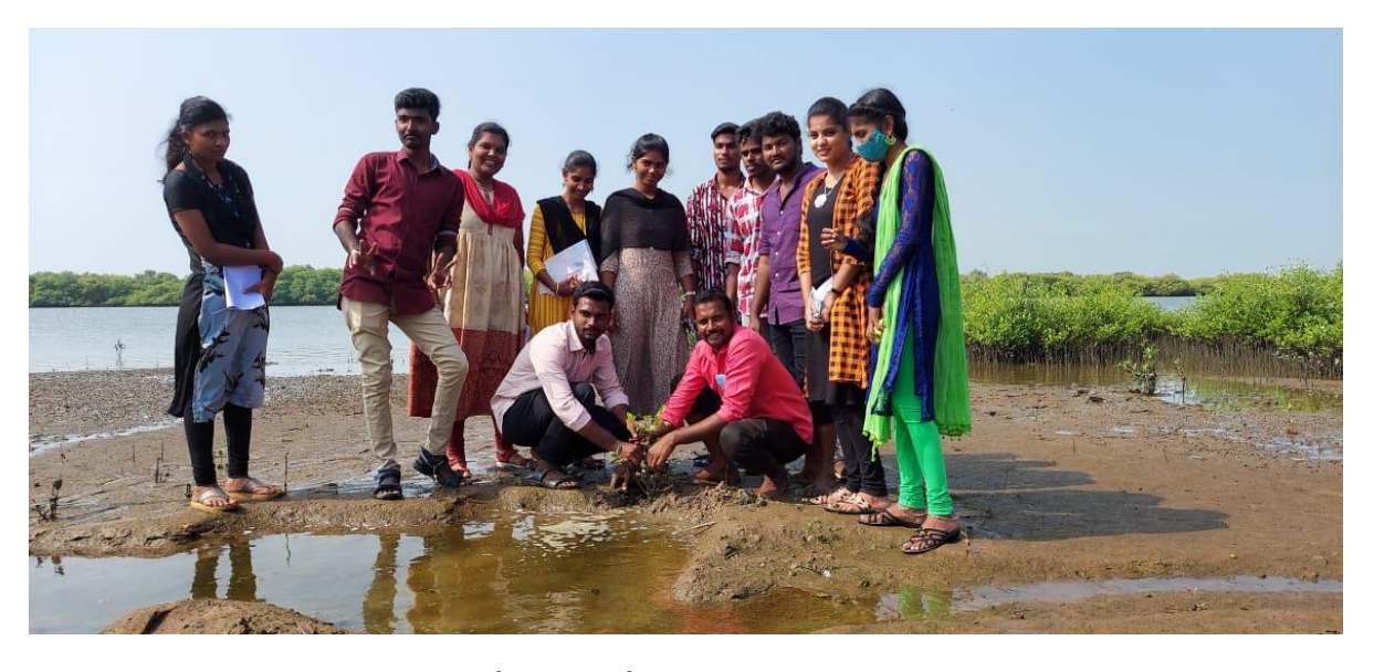
Planting of mangroves